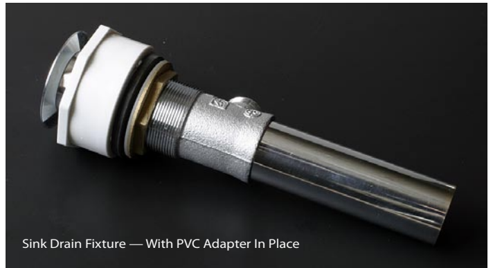
Sink Drain Fixture — With PVC Adapter In Place

The PVC drain adapter is installed as indicated in the cross section photos (at left and below) and as positioned on the example drain above. The underside of the sink drain flange (which faces the sink user) should be sealed with plumber's putty.