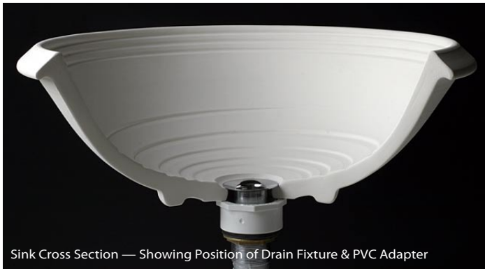
Sink Cross Section — Showing Position of Drain Fixture & PVC Adapter

Drain fixtures are made with different thread take-up lengths and bath sinks are made with different sink bowl thicknesses where the drain is secured to the sink.